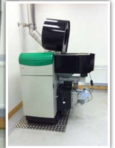
Easy access for burner and cyclone servicing