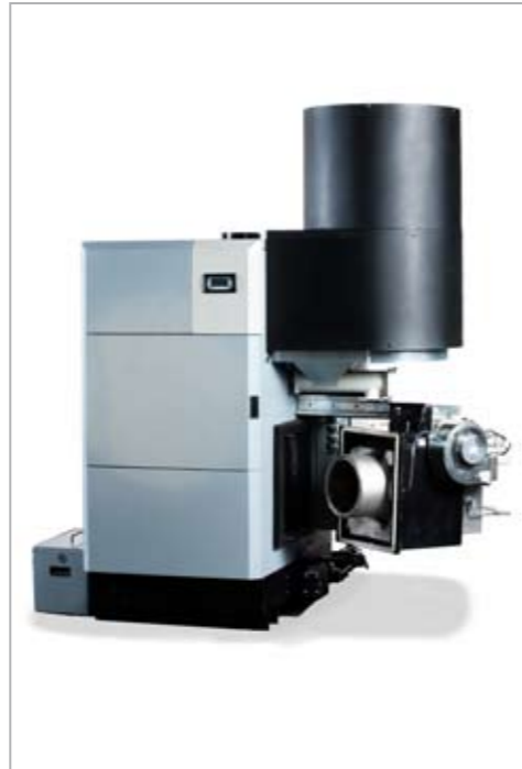
Wall mounted Cyclomatic pellet suction system