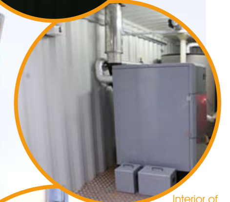
Interior of EcoCabin