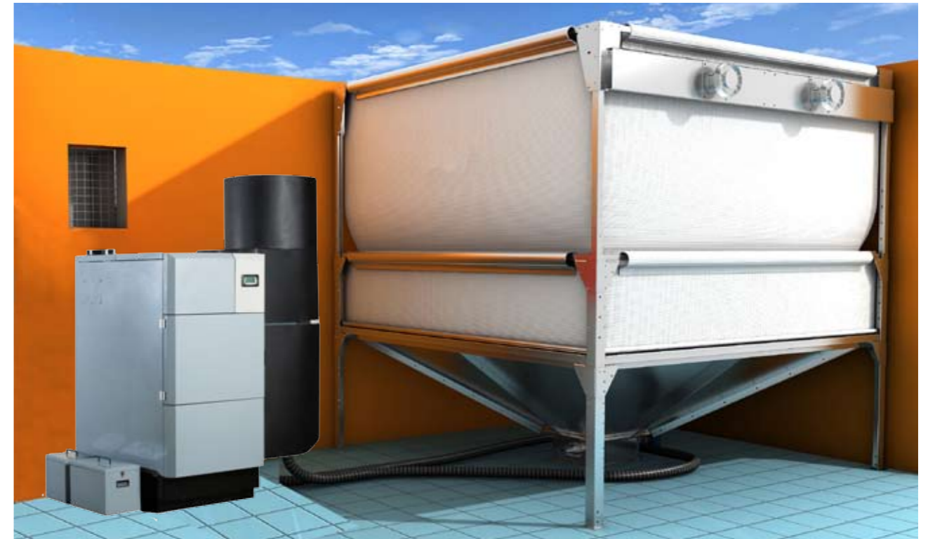
E-COMPACT 100 with 6 tonne Sack Silo