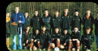
ST CLEER FOOTBALL CLUB

If we as a Company can encourage this success, we all need to support the next generation.