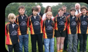
SALTASH RUGBY CLUB

We support local pro-youth groups within our community.